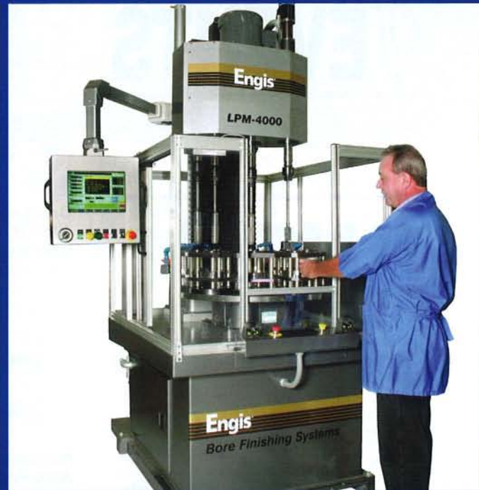
Machine utilizing single-pass bore process with diamond tooling.

products increased, so did need for sophistication of the production processes, and the firm has been awarded not only the ISO 9001 certificate for quality but ISO 14001 for a clean and safe working environment. High precision gears are essential to effective power transmission, lower noise, and the bike's overall performance. The firm's engineering staff presented a challenge to the plant's manufacturing team to achieve greater precision on the gear's bore. The application called for removing 0.050 mm of material from a 20mm diameter gear which was made of steel hardened to 58-64 HRc. The tolerance on the bore called for 0.015mm and the cylindricity needed to be held to 0.008mm with a finish requirement of 0.8Ra. The plant's engineers had first considered attempting to achieve this with conventional honing equipment, which utilizes abrasive stones which expand and contract with each cycle. But they fell short of their quality and cost objectives, which prompted them to begin to look at offshore options. They then contacted a US superabrasive supplier who was able to design a single pass honing system utilizing electroplated diamond tools. The supplier was able to significantly improve upon the results previously achieved with conventional honing. Bore tolerances of 0.007mm, cylindricities of 0.005mm, and finishes of