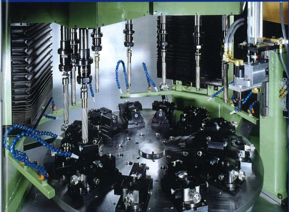
Among the most critical features in any system design is the workholding fixture.