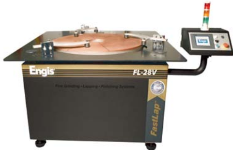
Model FL-28V Non-Pneumatic (Hand Weight)

Versatility and speed are the hallmarks for the newest line of Engis lapping and polishing machines.