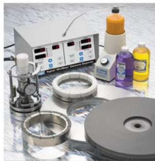
Full line of Hyprez® Slurries, Accessories, Lap Plates and Dispensing Systems are available