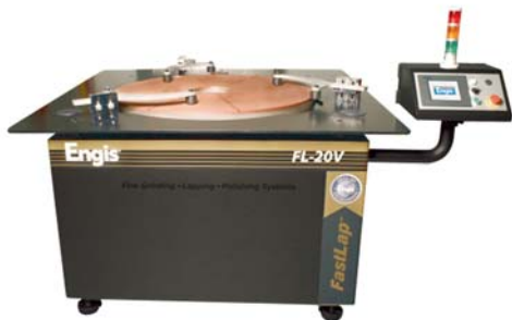
Model FL-20V Non-Pneumatic (Hand Weight)

Versatility and speed are the hallmarks for the newest line of Engis lapping and polishing machines.