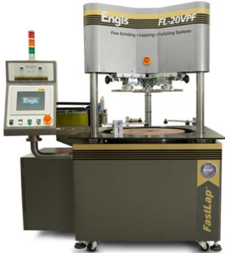
Model FL-20VPF (Pneumatic) shown above with optional Plate Facing and built-in Hyprez Minimiser/Auto Dispensing System