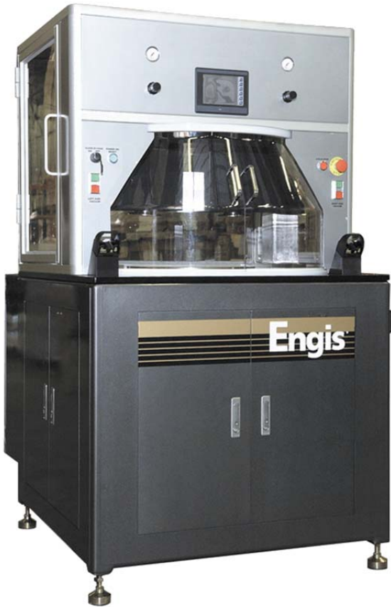
Standard Model AMX-18D shown

This series comes standard with two independently programmable Power Heads. To customize the system, users can order from a choice of platen speeds, power and downforce pressures. For higher performance, the system is available with plate oscillation.